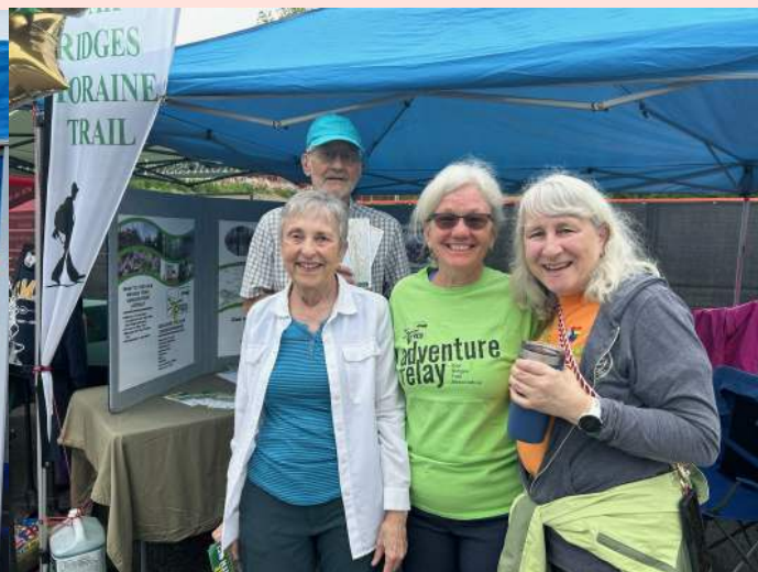
The Aurora Street Festival 2024 was another resounding success.