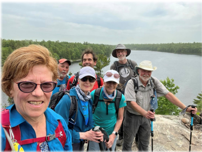
Photo credit: Janice Wainwright at McRae Lake (hike led by Russ Burton)