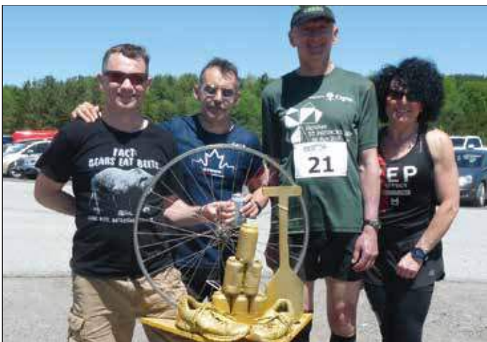
Team Trophy – painted gold. Each year a plaque is added.