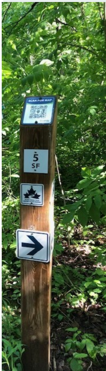
Left: Trans Canada Trail Decals

Our thanks to the Trans Canada Trail folks for their recent $1200 grant to ORTA for our maintenance and upgrades of the shared trails.