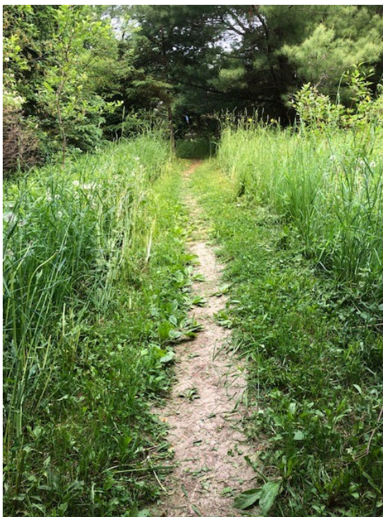
Below: Before and after pictures of the trail mowing