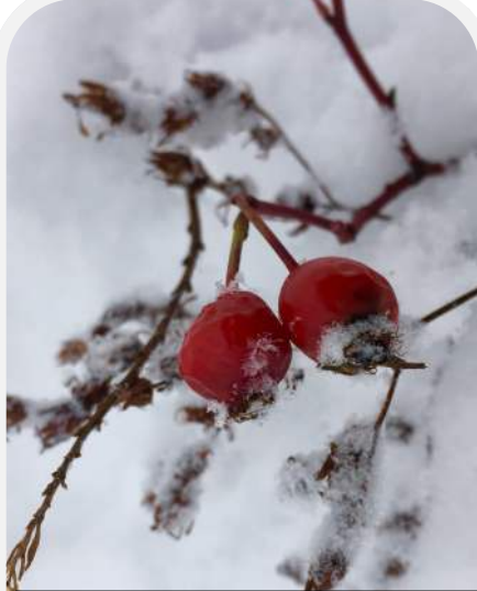
Top 2 pictures