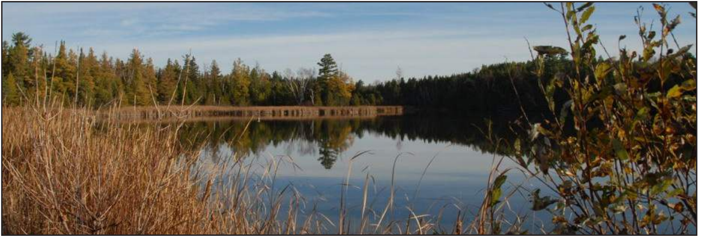
The Palgrave Millpond.

ORTA will soon celebrate the 25th anniversary of our beginnings in 1991. The Bruce Trail is in the midst of celebrating the 50th anniversary of its 1962-67 trail building. Why is the Bruce Trail so much older than ours? Surely they had a head start - the sediments that form the Niagara Escarpment were laid down more than 400 million years ago! The Oak Ridges Moraine formed a mere ten thousand years ago.