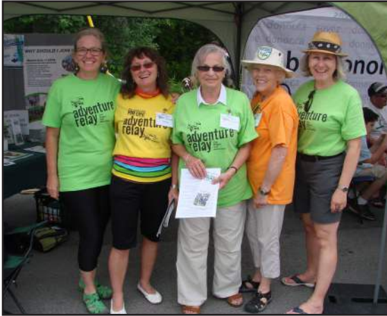
ORTA Volunteers at the Aurora Street Festival.

Summer arrives in Aurora with the annual Street Festival held on the first Sunday in June, rain or shine. The event is attended by throngs of visitors who parade along Yonge Street from Wellington to Murray Drive enjoying a variety of food and music. Vendors of all sorts are there, but many visitors come to learn about service groups and community activities.