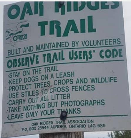
OAK RIDGES TRAIL USERS CODE