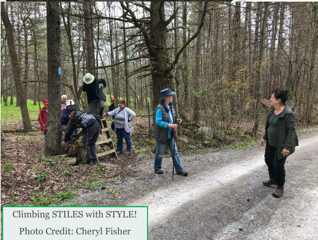
Climbing STILES with STYLE!