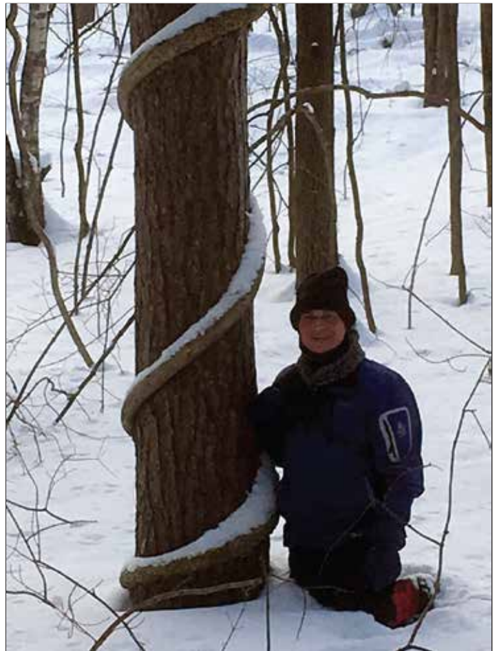
This is where the naming gets a little confusing. We needed to connect Stumpy to the bottom of One Gee thereby integrating the Big Meany loop. We worked some magic along both sides of the double track and a new loop was made on the west side bordering the BellRinger south of Stumpy named 'Skunk' after one of our dogs had an unfortunate incident there. Skunk terminated at the double track directly across from Big Meany and One Gee completing the 'whole loop'....."